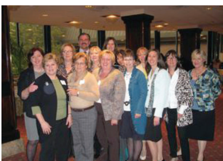
NPALI Board of Directors