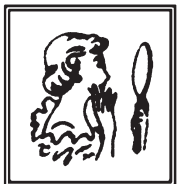
Syneron™ Laser Jet M

16 Pine Ridge Drive Smithtown, N.Y. 11787