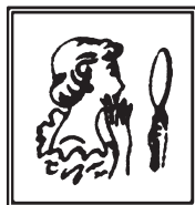
Syneron™ Laser Jet M